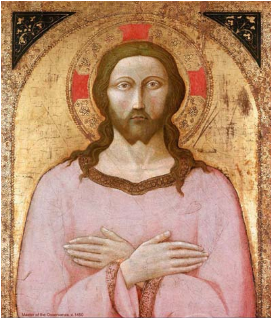
Master of the Osservanza, c. 1450