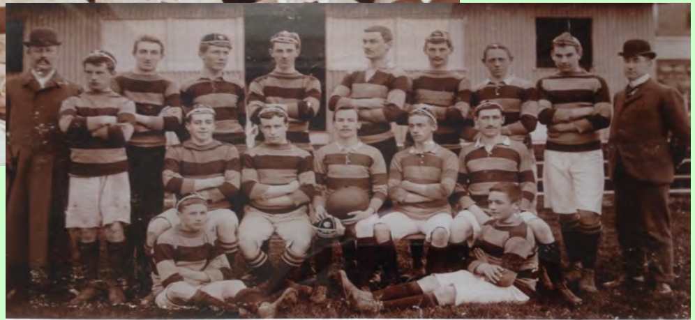
Monkstown 2nd XV. (Dublin Junior League.) 1896-97.