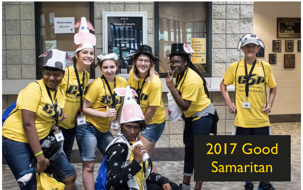
2017 Good Samaritan

to serve the community and have the opportunity to meet other youth from different parishes as well. To those who have not registered yet but still want to participate, please contact me and I will put you down on a waiting list . The date for week 1 is June 24-30 (Bishop McLaughlin) and week 2 is July 8-14 (St Petersburg).