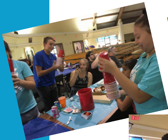
Teen Challenge: get the yellow cup to the top of the stack without dropping stack and rotating between right and left hands to put red cups on the bottom.