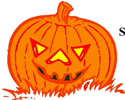
Photo ops for your children

Mon. - Fri. Noon - 8 pm Sat. & Sun. 9 am - 8 pm