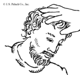
The Conversion of St. Paul

Some of Saint Paul's best known and most beloved imagery is contained in the passages from First Corinthians that we have heard last week and this week: the many gifts granted by the one same Spirit and the many members making up the one Body of Christ. Few passages from sacred scripture more accurately sum up how Christian vocations work together.