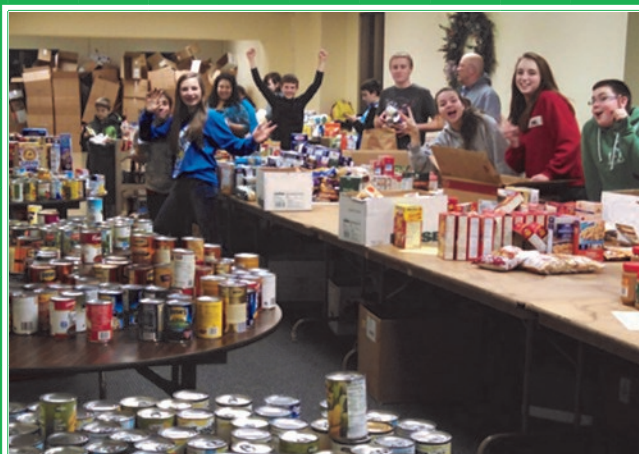
7 th and 8 th graders sorting food for Dexter Family Services for Christmas giving.

"What are you doing for others?" Martin Luther King, Jr.