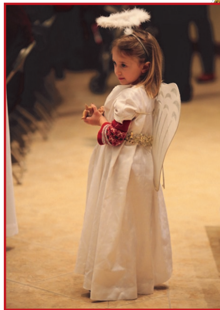
Bringing Baby Jesus to the manger.