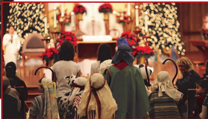
The shepherds and the stable animals.