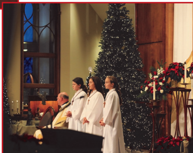
Ready to serve.