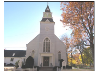
Immaculate Conception, Newburyport