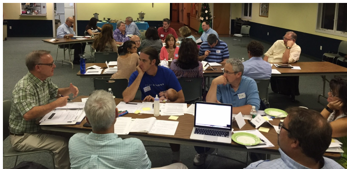
Members of the Collaborative Pastoral Plan Writing Team at work