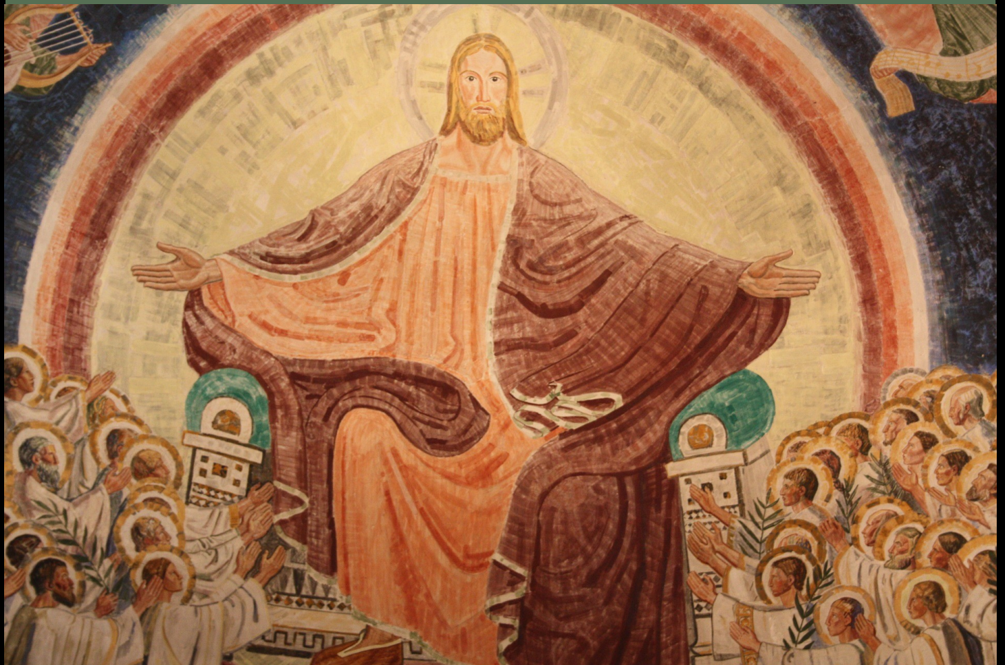
Image of Jesus Christ enthroned from Viborg Cathedral, Denmark

“For we do not have a high priest who is unable to sympathize with our weaknesses, but one who has similarly been tested in every way, yet without sin. So let us confidently approach the throne of grace to receive mercy and to find grace for timely help.” (Heb 4:15-16)