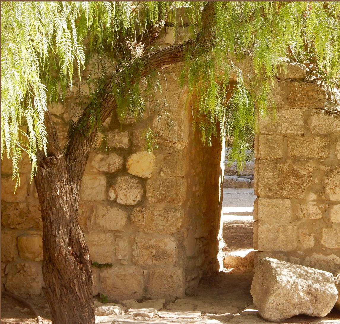
A rejected stone on the summit of Mt. Tabor in Israel

Jesus said to them, "Did you never read in the scriptures: 'The stone that the builders rejected has become the cornerstone; by the Lord has this been done, and it is wonderful in our eyes?'" (Mt. 21:42)