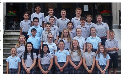
ICS Grade 8

objective, accurate, and considerate of audience and a losing team. Copies of the Daily News sports section, where Connor's articles are featured, often with large color photographs, helped the students to see the