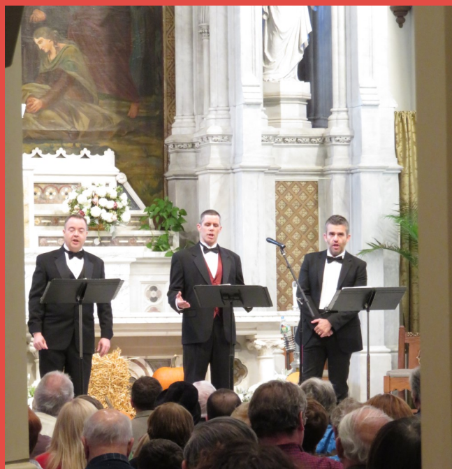
Scene from last year's wonderful show.

{Proceeds benefit the IC Society of St. Vincent de Paul}.