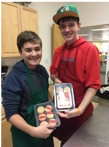
Left: Krispy Sushi snacks for the bake sale. Yumm!