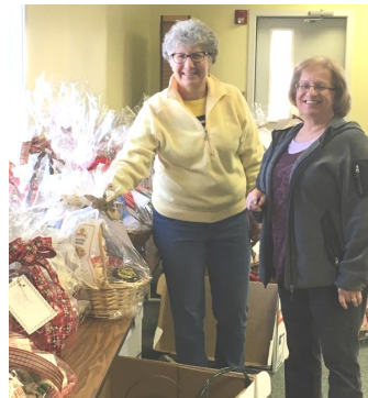
Below: Many baskets to choose from!