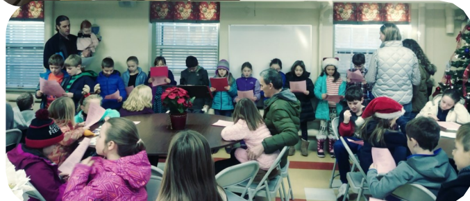
IC Rel. Ed. Sing-a-long

We will be hosting a fleece scarf making day on Sunday, January 21 from 11:15-1:00. Pizza will be served.