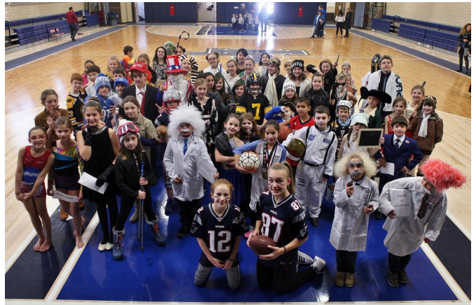
Our Wax Museum participants from Catholic Schools Week

Applications for new IC students are currently being accepted for the 2018–2019 school year. Enrollment is looking very strong, in that 97% of our current students have re-enrolled for next year. We have already accepted applications for 26 new students, across all grades. Hosting Open House events on a monthly basis has been very effective and consistently well attended. Seventy-five percent of families who have taken a tour of the school have formally applied to the IC. Our students are fantastic representatives of the IC, and are often complemented by visitors who tour the building.