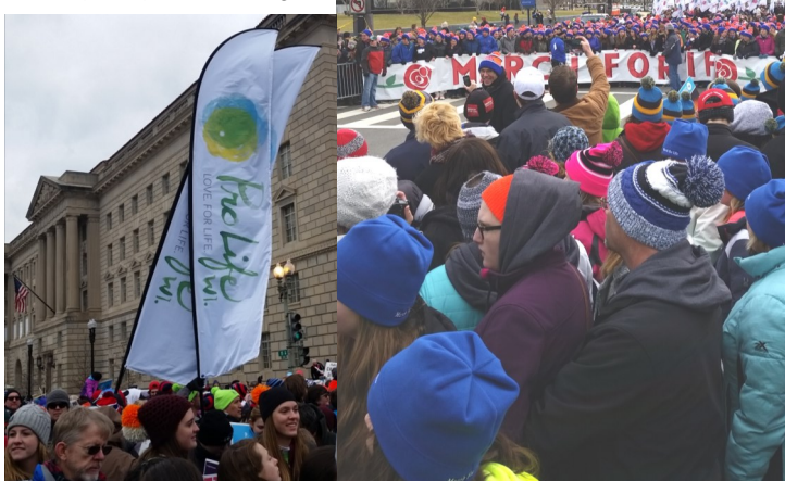
March for Life in Washington