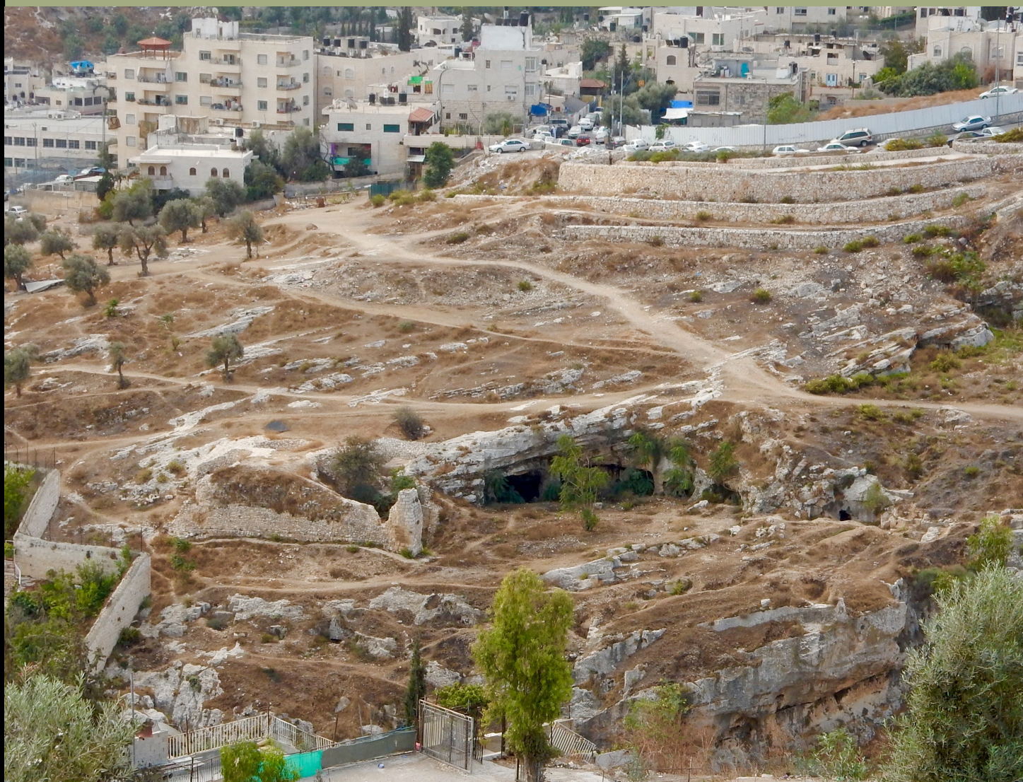
Gehena, as it is today, just outside the walls of modern Jerusalem

"If your right eye causes you to sin, tear it out and throw it away. It is better for you to lose one of your members than to have your whole body thrown into Gehenna." (Mt. 5:29)