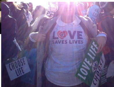
"Love Saves Lives" was the theme of this year's march.