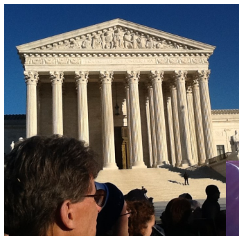
The Supreme Court

They then returned to the bus and headed home. This was a sad but very hopeful trip.