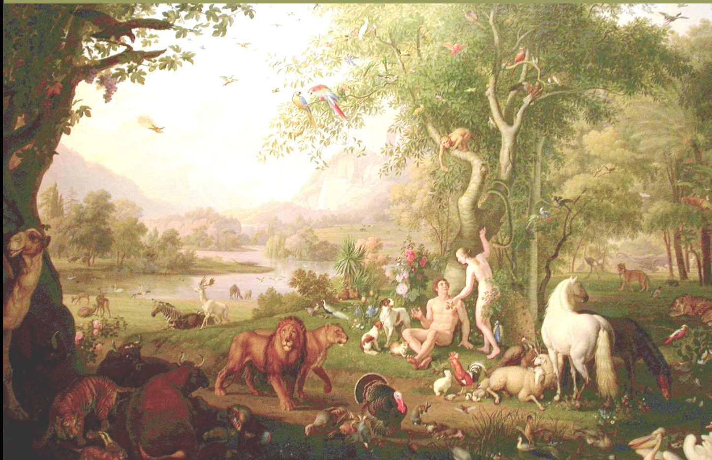
“Adam and Eve in the Garden of Eden” by Wenzel Peter. 19th Century oil on canvas from the Vatican Museum Collection

“The woman saw that the tree was good for food, pleasing to the eyes, and desirable for gaining wisdom. So she took some of its fruit and ate it; and she also gave some to her husband, who was with her, and he ate it.” (Gn 3:6)