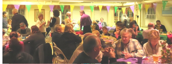
Collaborative Mardi Gras fun.