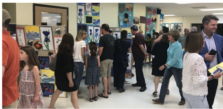
Fine Arts Night

The theatrical talents of our students will take the stage the evening of May 31 and June 1 as we present Seussical, Jr. All are welcome!