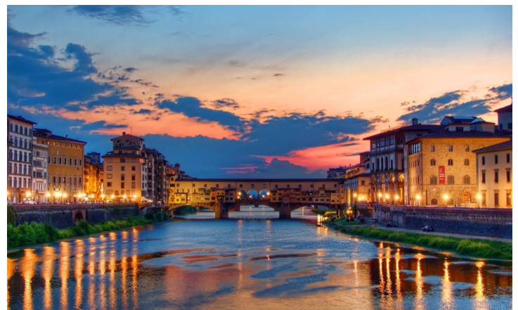
Florence at sunset