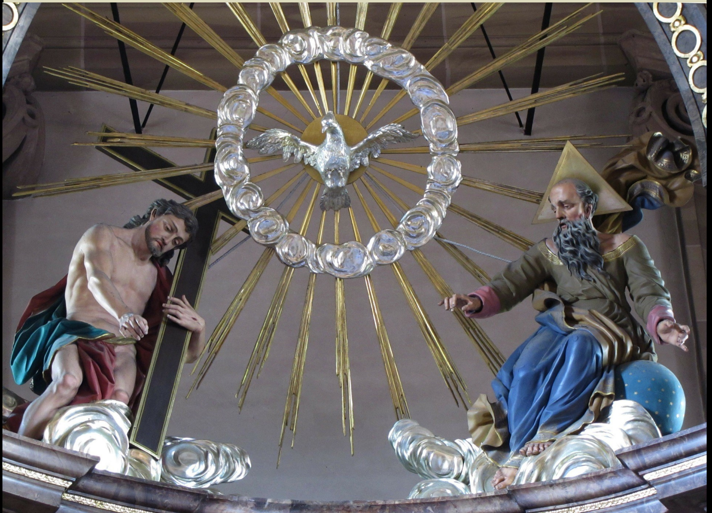
Baroque carving of the Holy Trinity from a church in France

“All power in heaven and on earth has been given to me. Go, therefore, and make disciples of all nations, baptizing them in the name of the Father, and of the Son, and of the Holy Spirit, teaching them to observe all that I have commanded you.” (Mt. 28: 18-20)