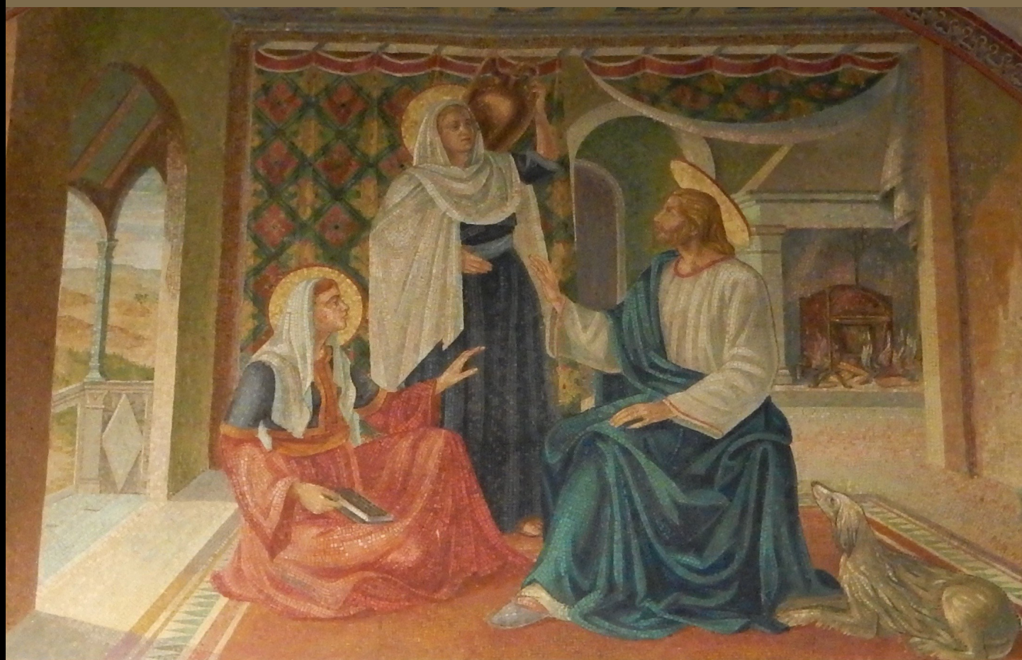
Mosaic of Martha, Mary, and Jesus from the Church outside of Lazarus' Tomb in Bethany

"Martha, Martha, you are anxious and worried about many things. There is need of only one thing. Mary has chosen the better part and it will not be taken from her." Lk 10:42