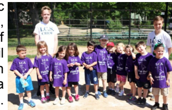
Pre-K students at Field Day 2017