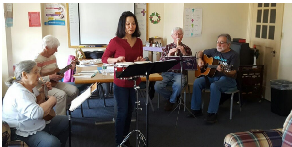
The Holy Jammers is an impromptu group of musicians that meet on Wednesdays in the IC Pastoral Center, second floor, at 9:00am. Anyone is welcome. Bring your instrument.

You can attend Mass at any worship site in our Collaborative and use your usual offertory envelope. Drop it in the collection and we make sure it is delivered to your home Parish.