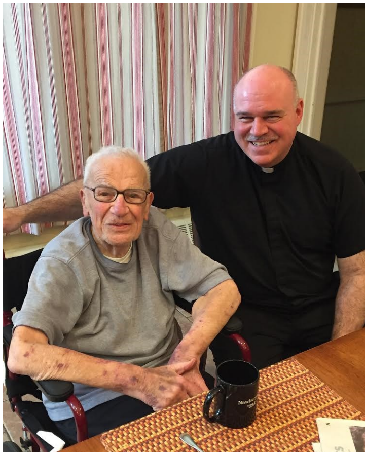
Look what the cat dragged in!

She is happy to help our parishioners who are in need.