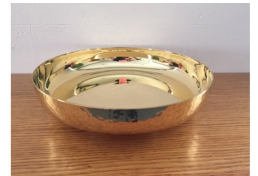
large community paten