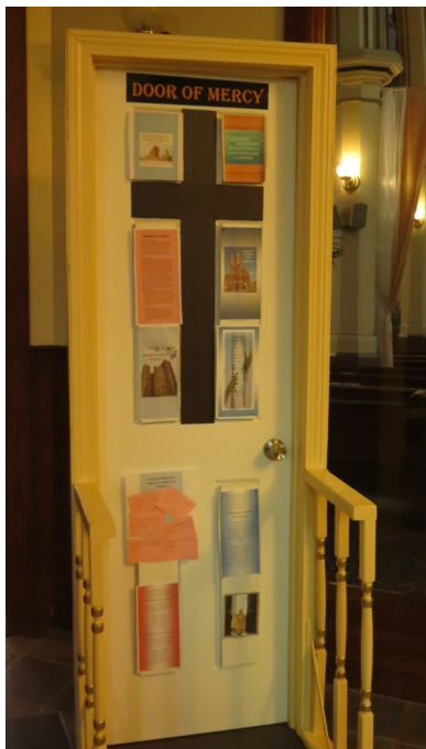
Door of Mercy at Immaculate Conception

Grow in your spiritual journey during this Jubilee Year of Mercy with the 365 Days to Mercy app. Download it free in the iTunes and Google Play stores. The app features Scripture reflections, resources, news, prayers, OSV book reviews, and more to inspire all.