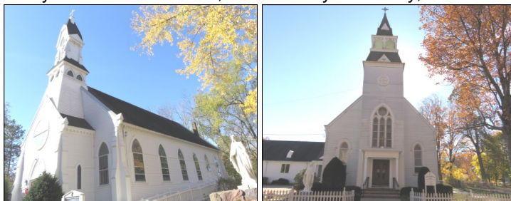
Immaculate Conception, Newburyport

Holy Redeemer: St. Ann, W. Newbury & Nativity, Merrimac