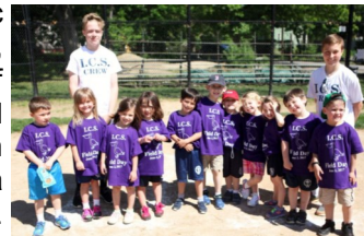
Pre-K students at Field Day 2017

978-465-7780, jsullivan@newburyportcatholic.org .