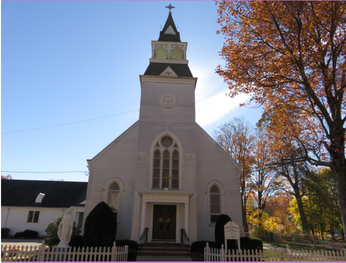
Church of the Nativity