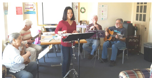
The Holy Jammers is an impromptu group of musicians that meet on Wednesdays in the IC Pastoral Center, second floor, at 9:00am. Anyone is welcome. Bring your instrument.