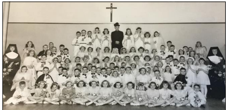
First Communion Class of 1937