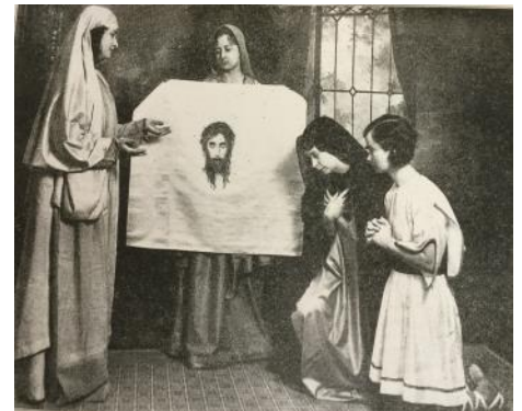
-scene from "The Upper Room"