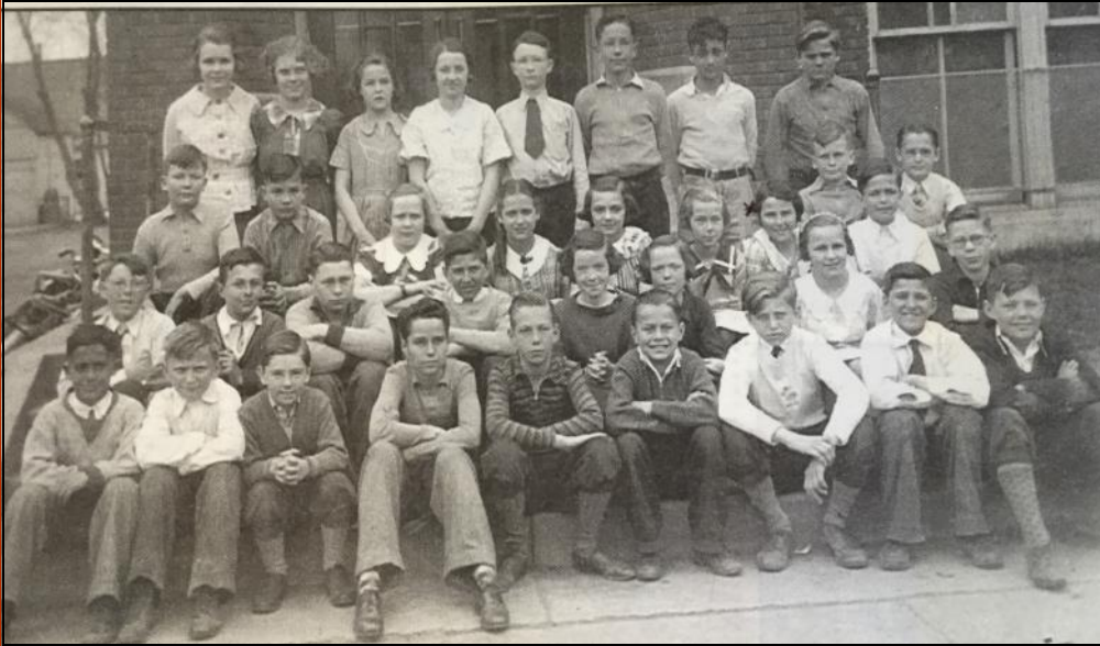
St. Anthony's 6th Grade class— picture taken on May 5, 1936