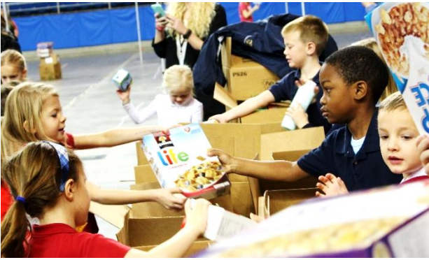
Kindergarteners helping with Fill the Dome

St. John Paul II Catholic Schools' Students do service projects starting with the 3-year-old Deacons through 12 th grade. They learn early that we are part of a larger community and we all need to share our time, talents, and treasures.