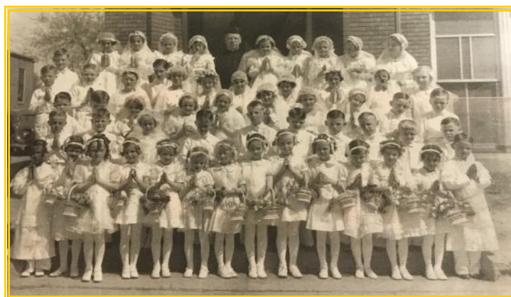
The REAL First Communion Class of 1937

A number of vocations from St. Anthony's to the consecrated life came as a result of the influence of the sisters. Their spirit of service, prayer, and hard work made a lasting impression on many young people.