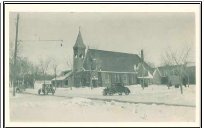
This picture was taken in the early 1920's, looking northeast across 10th St.

St. Anthony's Church was initially built as a chapel to serve the people on the south-side of Fargo. This also took care of the over-crowding of another church, in this case, St. Mary's. The Catholic population in Fargo had grown rapidly and Bishop O'Reilly acted swiftly to create the new parish.