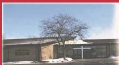
St. Thomas the Apostle

Good and Gracious God, You created human beings in Your image and likeness and gave us dominion over creation to be stewards of the land and co-creators of Your Kingdom. Jesus, You became one of us and labored as a carpenter. You ask all people -- whatever our state of life -- to follow you faithfully.