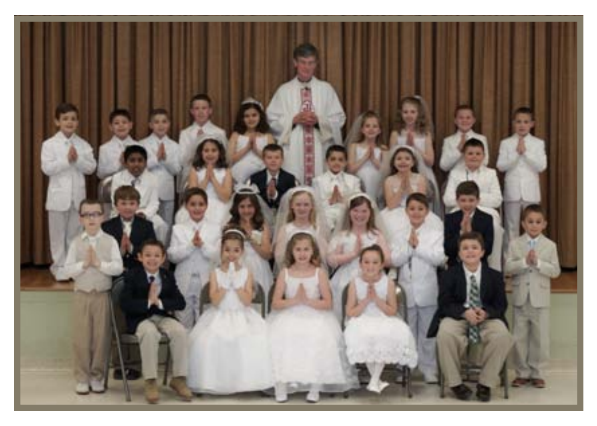
May 2, 2015 First Holy Communicants

North Reading, Massachusetts May 31, 2015 ~ Most Holy Trinity