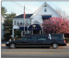
(Large New Addition Just Added)