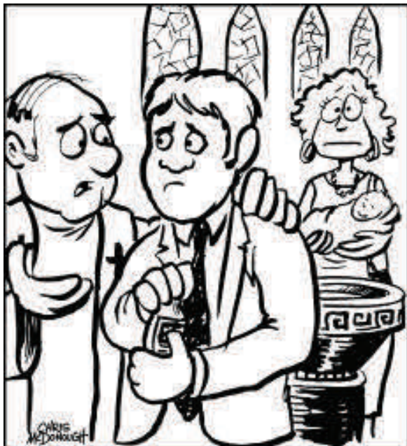
"I know you want to guarantee he'll be a great athlete, but I can't substitute Gatorade® for baptismal oil."

The Source and Summit of everything we do as Catholics is the Eucharist, aka: Holy Communion. Jesus said in the Gospel of John 6:51 , "I am the living bread that came down from heaven; whoever eats this bread will live forever; and the bread that I will give is my flesh for the life of the world." We take this very literally. At the Last Supper Jesus took bread and wine, blessed them and said, "This is my body" "This is my blood" and "Do this in memory of me." ( Luke 22 ) We take this, with the Gospel of John very literally, too. Jesus' Sacrifice for us on the Cross is what we celebrate at Mass. He made that Sacrifice once and for all, but told us to participate in it, too. Our celebration of this Sacrifice isn't a new one; it brings the one and only Sacrifice into the present. The hosts and wine change from those elements to His True Presence—to the Body and Blood of Christ. It's not a symbol for us. It's a reality. And so, we ask that only those who are united with us in that belief through the Catholic Church participate in receiving Communion.