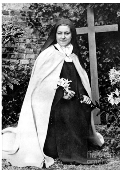
St. Therese of Lisieux 1873-1897

Our Lord needs from us neither great deeds nor profound thoughts. Neither intelligence nor talents. He cherishes simplicity.