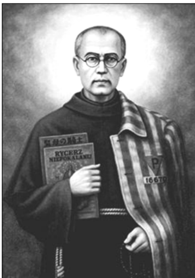
St. Maximilian Kolbe 1894-1941

August 14 was the feast day of St. Maximilian Kolbe . St. Maximilian was a Franciscan priest captured by the Nazis and