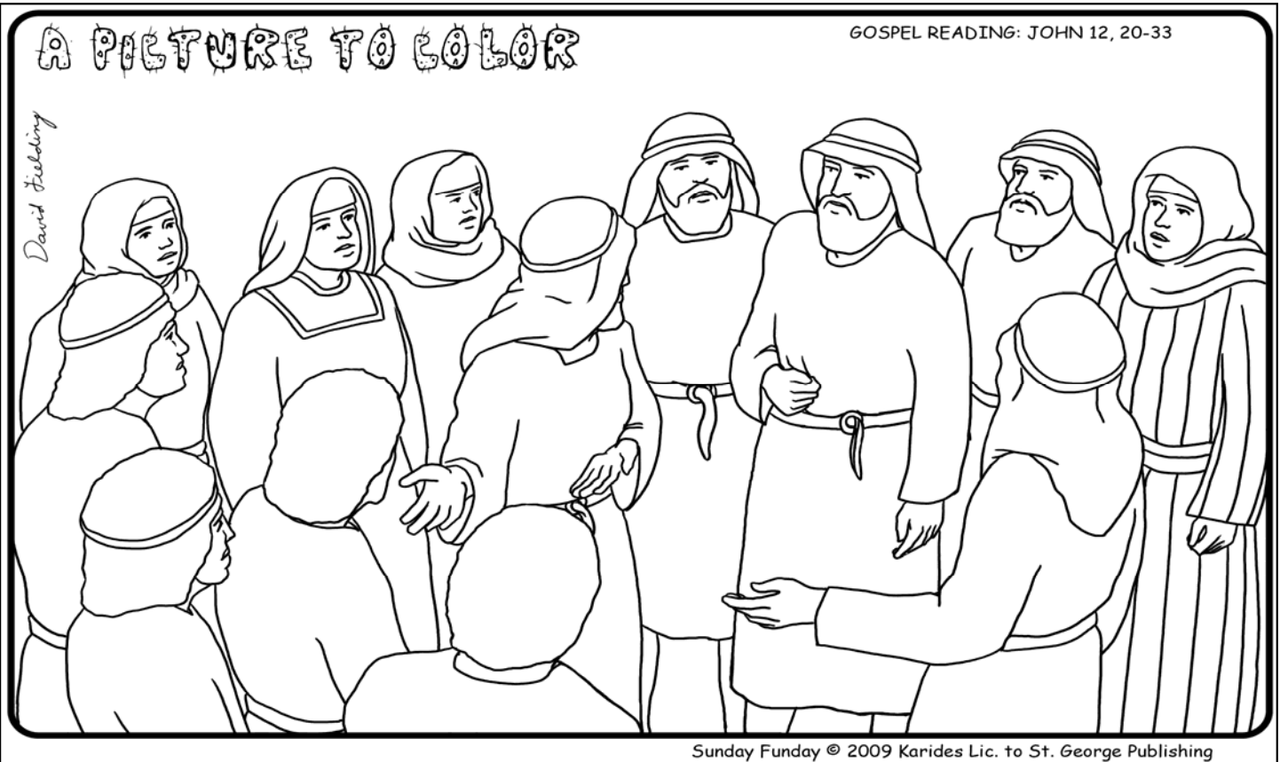
Sunday Funday © 2009 Karides Lic. to St. George Publishing

much more to enhance your marriage visit www.foryourmarriage.org .