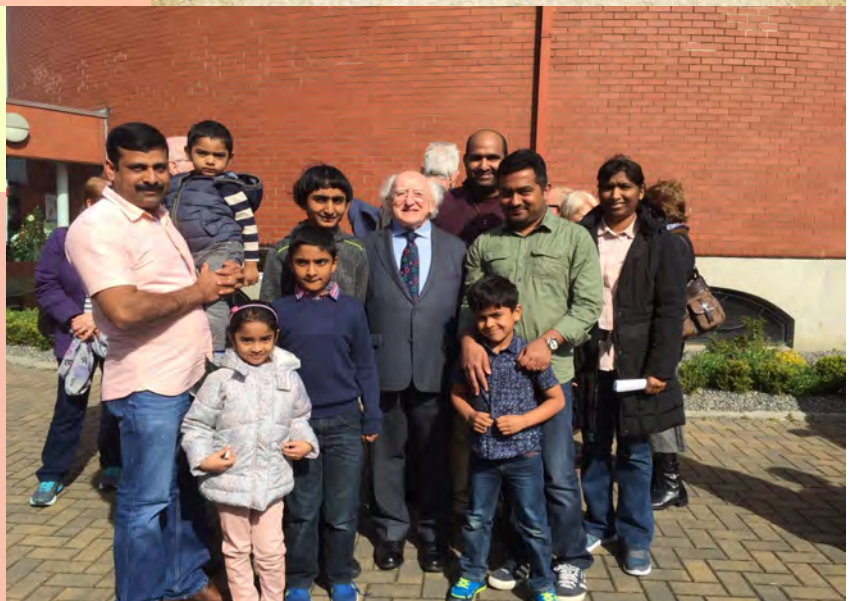
President Michael D. Higgins meets some parishioners after Mass on 26th of March.

In aid of Sandyford Men's Shed and Balally Family Resource Centre