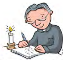
From Father's Desk