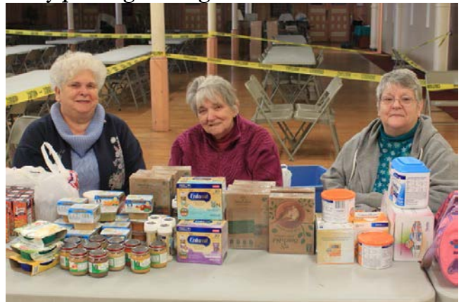
Ladies helping take care of the infant's needs.