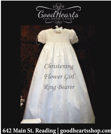
642 Main St. Reading | goodheartsshop.com

781-665-3100 Automatic Delivery • 24-Hr. Burner Service Budget Payment Plans • Service Contracts Fuel Assistance Family Owned & Operated for Over 35 Years! Heating Systems & Boiler Installations