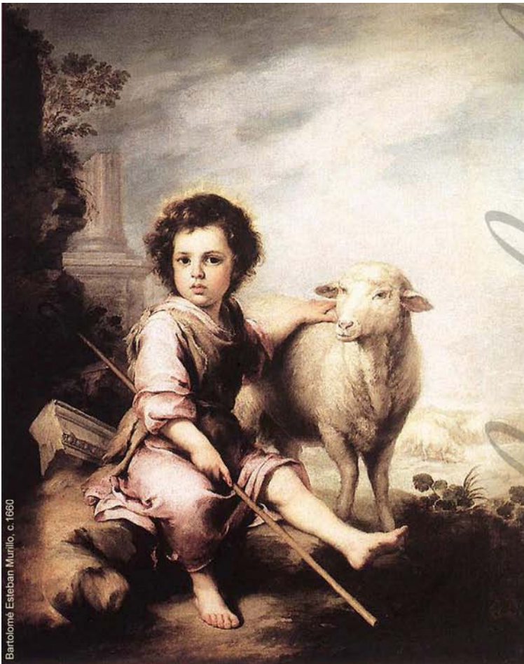
Bartolomé Estéban Murillo, c. 1660