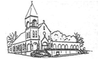
St. Patrick's - Missouri Valley