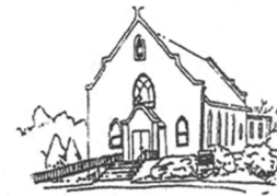
St. Anne's - Logan