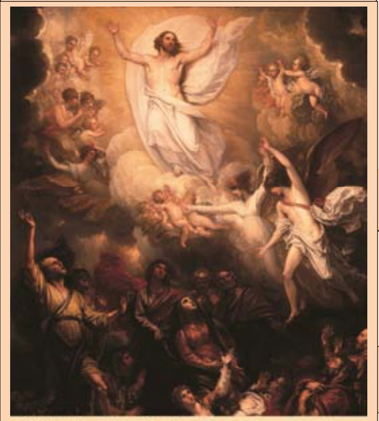
"Go into the whole world and proclaim the gospel to every creature." - Mak INT