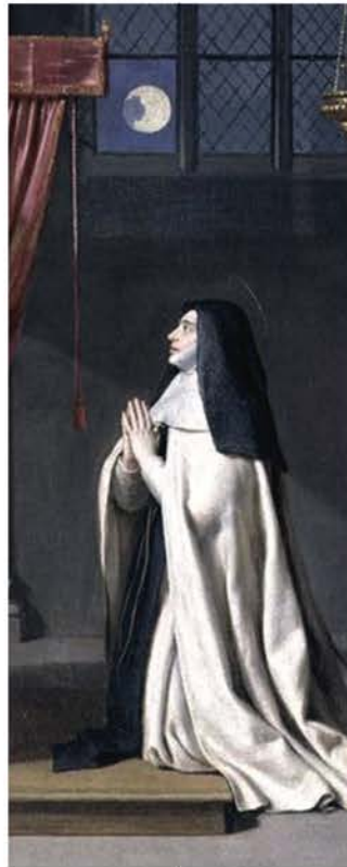
THE VISION OF ST. JULIANA OF MONT CORNILION, PHILIPPE DE CHAMPAGNE (ABOUT 1645-50)

Christian theology owes a debt to the pre-Christian philosophies of Plato and Aristotle. Early church theologian Justin was able to see connections between the great philosophers of Greek antiquity and the wisdom revealed by Jesus. The prologue of John's Gospel speaks of Jesus as "Logos," the preexisting Word. Justin believed that the "seeds of Christianity" found in thinkers such as Plato