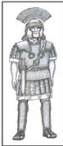
Sunday Funday

Six centuries made up one cohort. We know from ancient inscriptions that there was an "Italian Cohort" in the Holy Land.