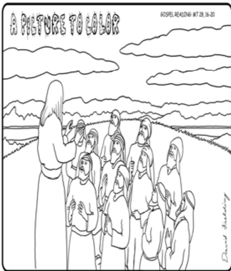
Sunday Fundy

Does it matter? YES!!!! It is about RESPECT for God, for self and for others!! Just something to think about in the weeks ahead.