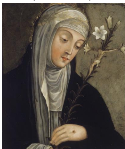
April 29 Patron of Nurses

St. Catherine of Siena Parish (est. 1892)