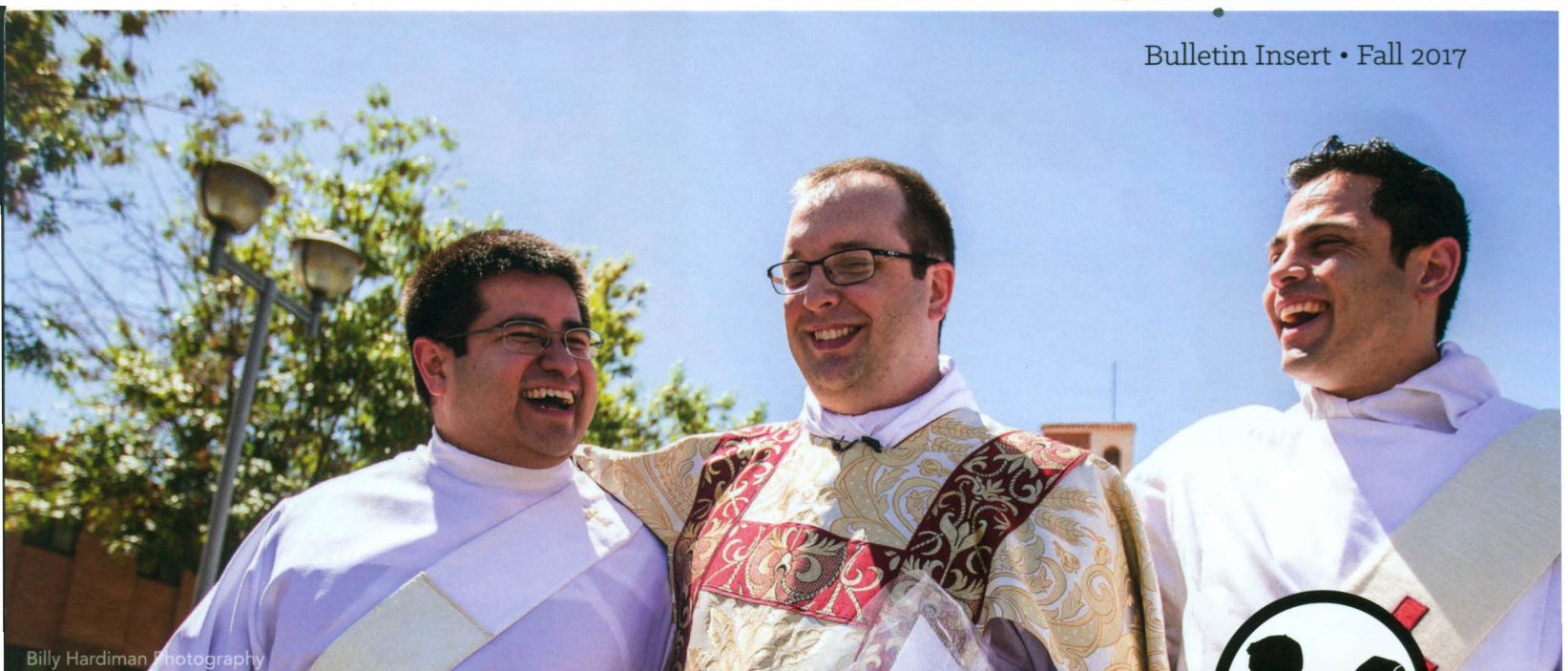
Billy Hardiman Photography