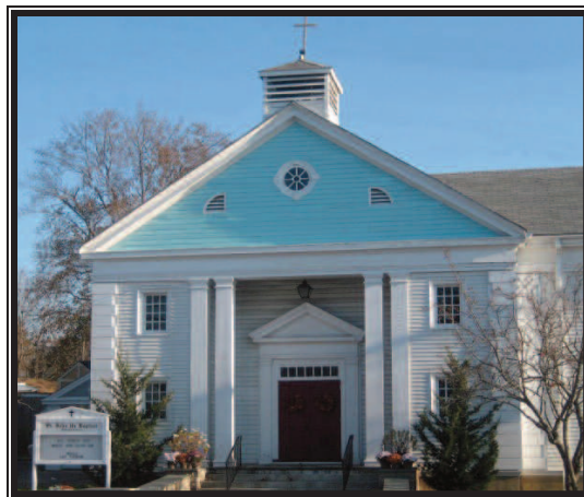
St. John the Baptist Church 52 Main St. Essex, MA 01929-1343 Established 1931

We are here to welcome and serve you. No matter what your present status in the Catholic Church. No matter what your current family or marital situation, No matter your personal history, age, background, race, etc., No matter what your self image— You are invited, welcomed, accepted, loved and respected in Sacred Heart and St. John the Baptist Parishes.