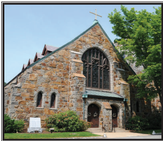
Sacred Heart Church 62 School St. Manchester-by-the-Sea, MA 01944-1342 Established 1905