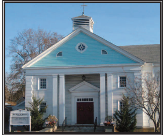
St. John the Baptist Church 52 Main St. Essex, MA 01929-1343 Established 1931

We are here to welcome and serve you. No matter what your present status in the Catholic Church. No matter what your current family or marital situation, No matter your personal history, age, background, race, etc., No matter what your self image— You are invited, welcomed, accepted, loved and respected in Sacred Heart and St. John the Baptist Parishes.