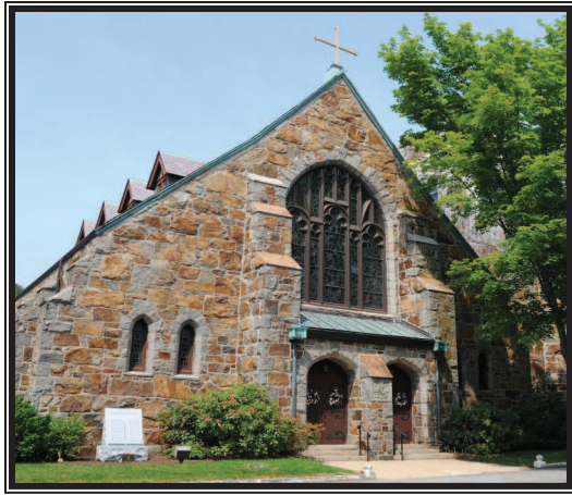
Sacred Heart Church 62 School St. Manchester-by-the-Sea, MA 01944-1342 Established 1905