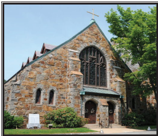
Sacred Heart Church 62 School St. Manchester-by-the-Sea, MA 01944-1342 Established 1905