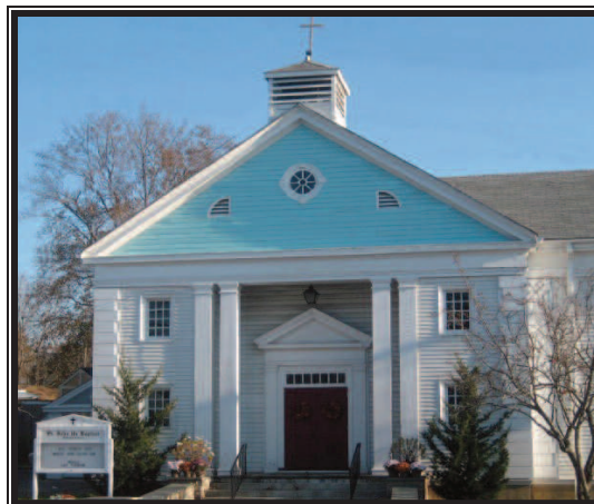
St. John the Baptist Church 52 Main St. Essex, MA 01929-1343 Established 1931

We are here to welcome and serve you. No matter what your present status in the Catholic Church. No matter what your current family or marital situation, No matter your personal history, age, background, race, etc., No matter what your self image— You are invited, welcomed, accepted, loved and respected in Sacred Heart and St. John the Baptist Parishes.