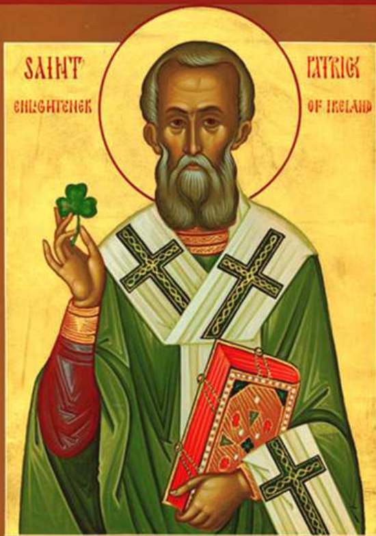
Feast of St. Patrick - March 17